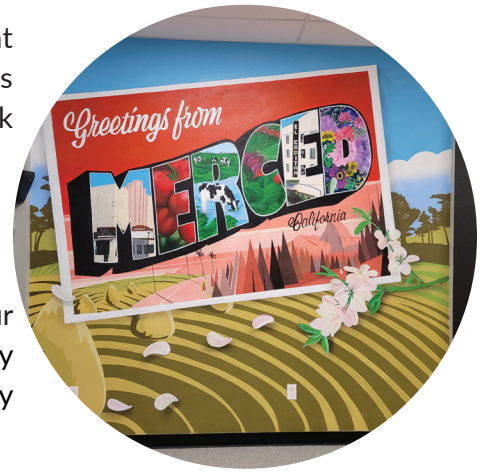
Mural Design Inspiration

Our community benefits and investments plan in Madera will build on our history of community involvement in other jurisdictions, such as in Monterey County and Union City. Examples of our proven track record of community outreach are provided below: