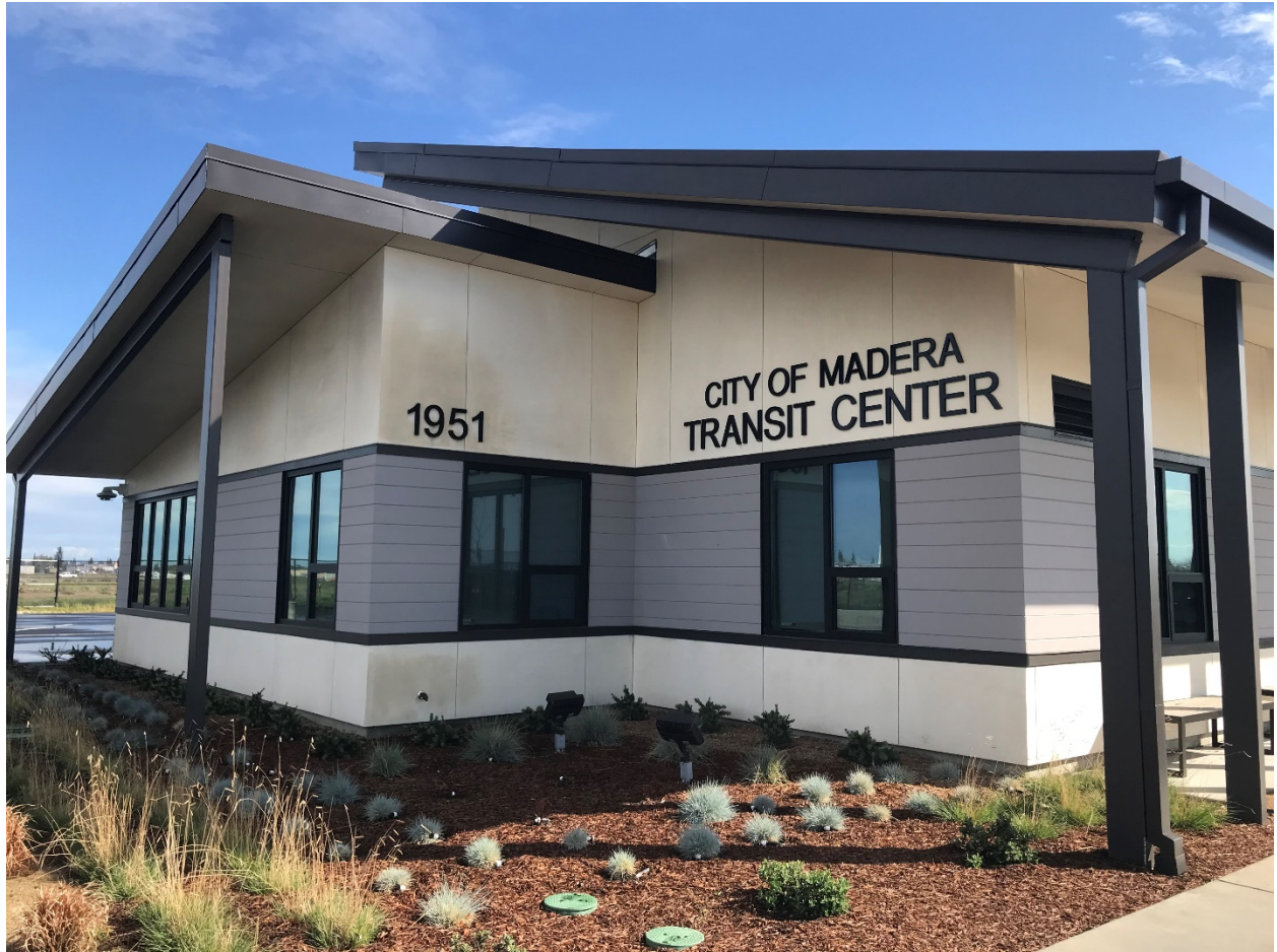
Figure 1: Exterior of the City of Madera Transit Center