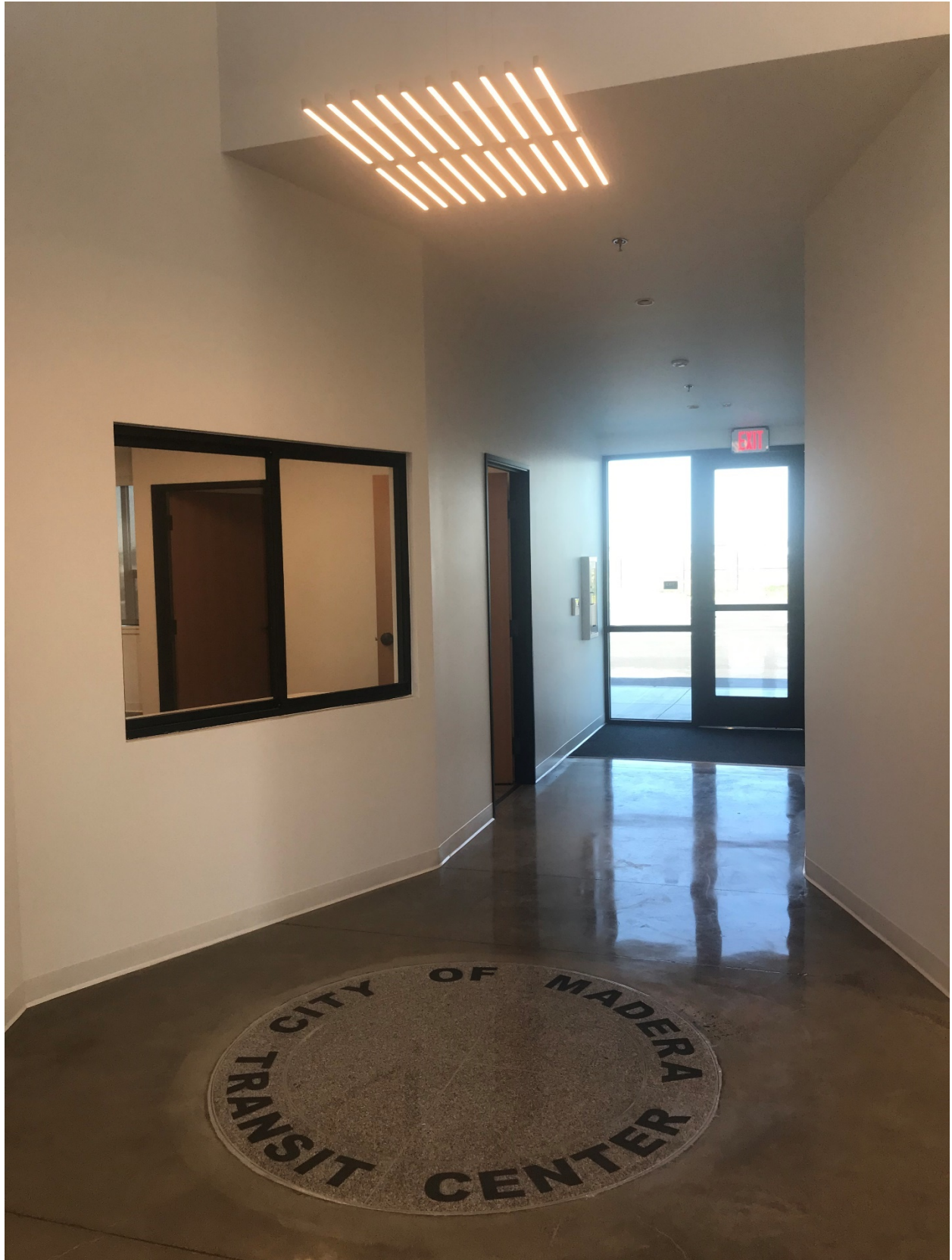
Figure 2: Interior of the City of Madera Transit Center