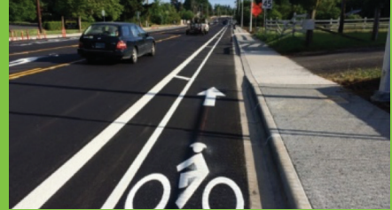
BUFFERED BIKE LANES