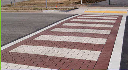
HIGH VISIBILITY CROSSWALKS

Creating a multi-modal pedestrian-friendly environment requires the implementation of traffic calming devices that encourage vehicles to travel at slower speeds. The following improvements are samples of traffic calming devices that are being considered for the project.