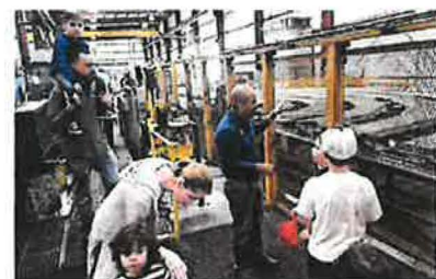
Evapco West marks 40 years in business